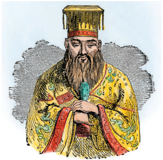
The teachings of Kong Qiu, known in the West as Confucius, shaped how some people in ancient China thought about life.

inspired by the problems he saw in society. People who learned from Confucius later wrote down his teachings. Over thousands of years, these writings have been reexamined and reshaped into a philosophy we now know as Confucianism.