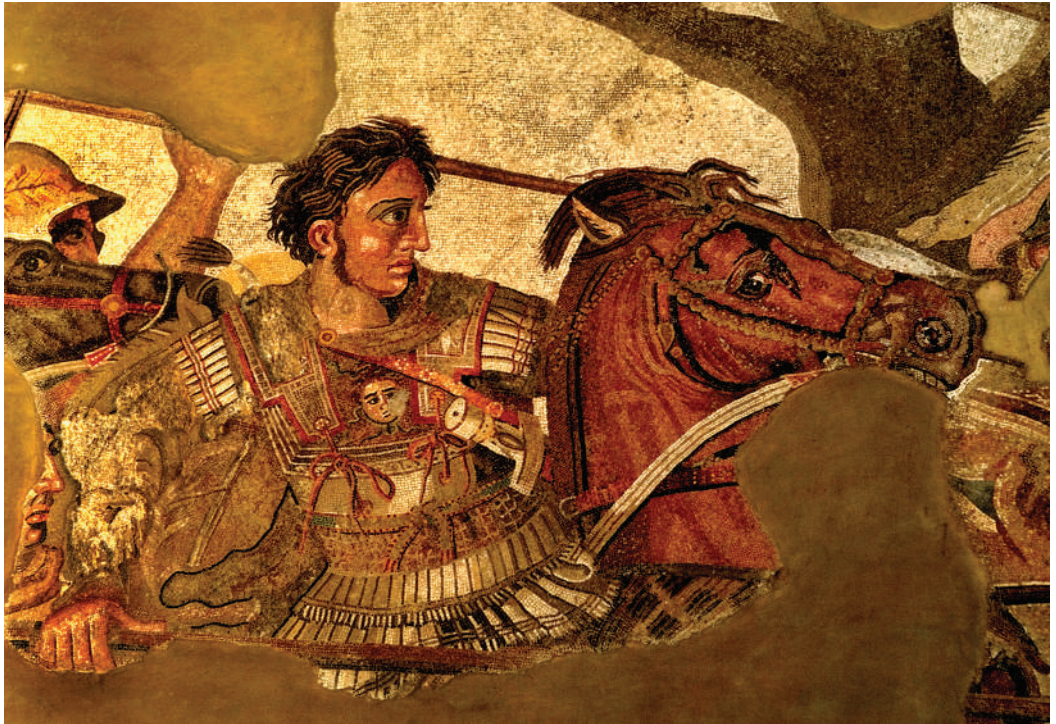
Alexander the Great is considered one of the most determined conquerors in world history.

After his father's death, Alexander decided to attack Greece's old enemies, the Persians. In 334 BCE, the Persian Empire was still very large. It extended all the way to the shores of the Mediterranean Sea and included present-day Iran, Afghanistan, Turkey, the Middle East, and Egypt. Alexander conquered it all, establishing himself