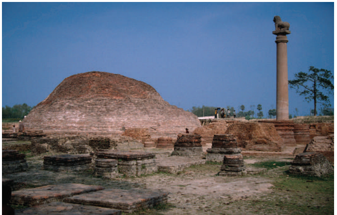
Some of the stupas and pillars Ashoka built still exist in India today.

ideas and practices of Buddhism. People traveled to visit these holy sites, which increased trade and added to the wealth of the Mauryan Empire.