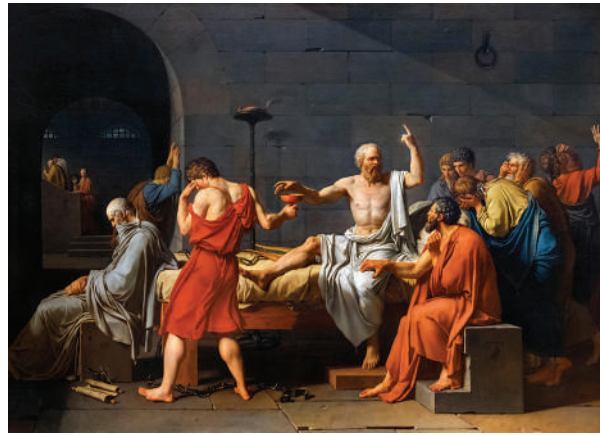
This painting is called The Death of Socrates . It was painted by Jacques-Louis David, a French artist, in the 1700s CE.

In his text The Republic , Plato lays out his vision of a perfect society. This society is strictly organized with a wise ruler, the philosopher-king, at the top. The philosopher-king, as Plato imagined him, is curious and clever. As such, he can make the best decisions for society.