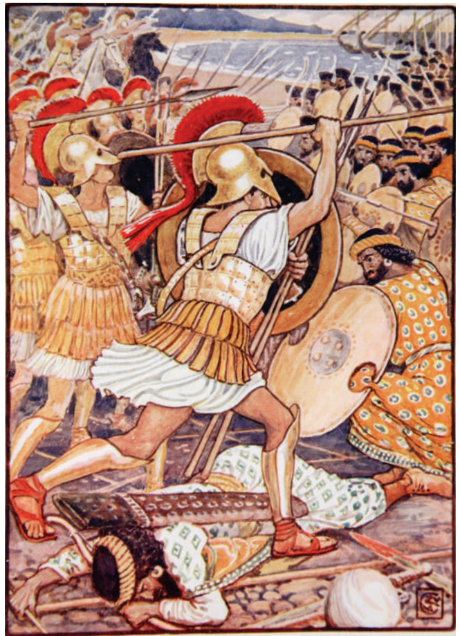
Although they were greatly outnumbered by the Persians, the Athenians were victorious at the Battle of Marathon.

Persian Wars, Athens and Sparta were the two leading Greek city-states. They had united for the cause of the war. However, as soon as it was over, they took separate paths.