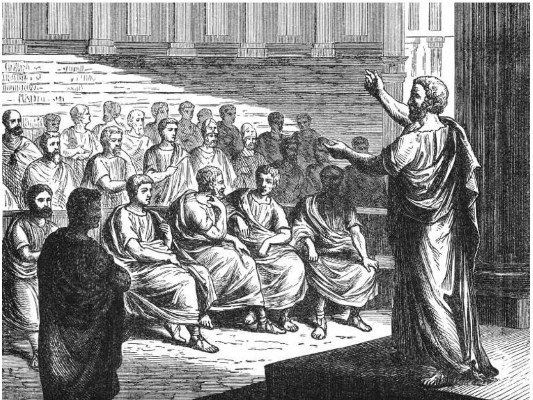
In Athens, the assembly debated and voted on issues.

jury , n. a group of people who listen to information presented in court and make decisions about whether or not someone is guilty