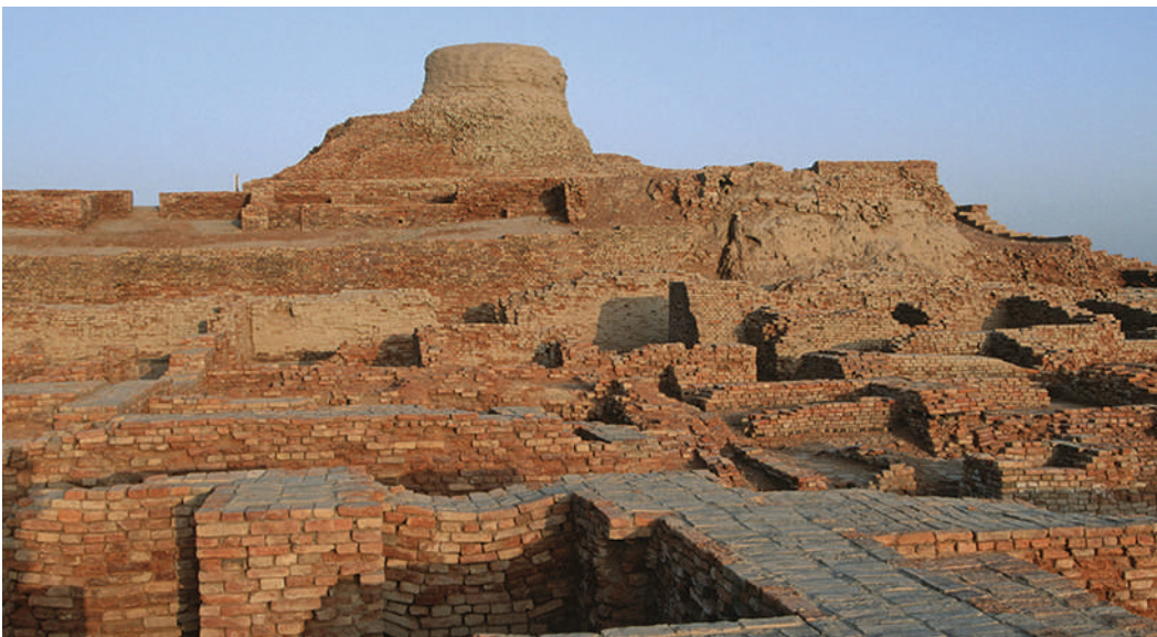
Some of the brick walls and streets of Mohenjo-Daro can still be found in Pakistan today.

The many achievements of the people who lived in the Indus valley can also be seen in how and what they built. Like the streets, houses and buildings were also constructed with bricks.