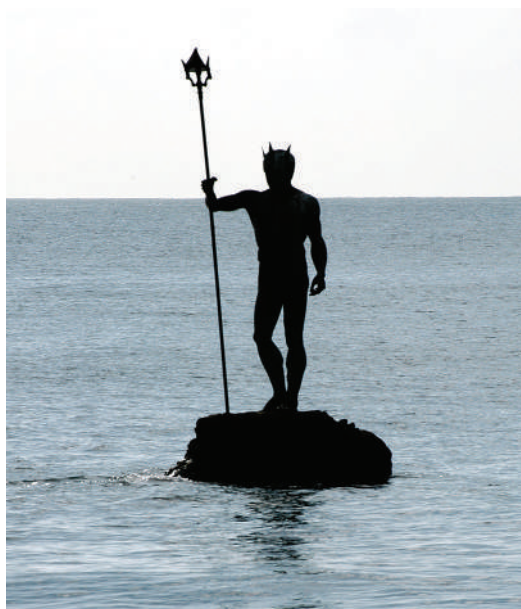
The myths about ancient Greek gods are still known around the world. Today, a statue of Poseidon, the Greek god of the sea, stands in Gran Canaria, one of Spain's Canary Islands.

The Greeks believed that it was necessary to honor, thank, and bargain with the gods to have a happy life. They did this in different ways. They built temples to honor them. They also told stories, or myths , about the gods' adventures—both good and bad ones. The Greeks used the alphabet of one of their trading partners, the Phoenicians, to develop their own alphabet. This was used to write down the myths as well as many other important texts and records. Over time, the myths became known across much of the world.