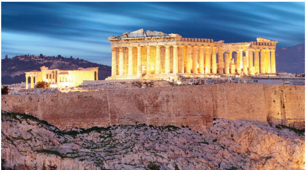
This photo shows the remains of the Acropolis in Athens, including the Parthenon. It was badly damaged by an explosion in the late 1600s CE, but it still stands today.

Athens also became known for its unique pottery, including bowls, urns, and vases. Craftspeople often decorated the pottery with pictures that showed Greek myths, religious practices, sports, and everyday scenes. As with the city's myths and plays, Athenian pottery made its way all around the Greek world and beyond.