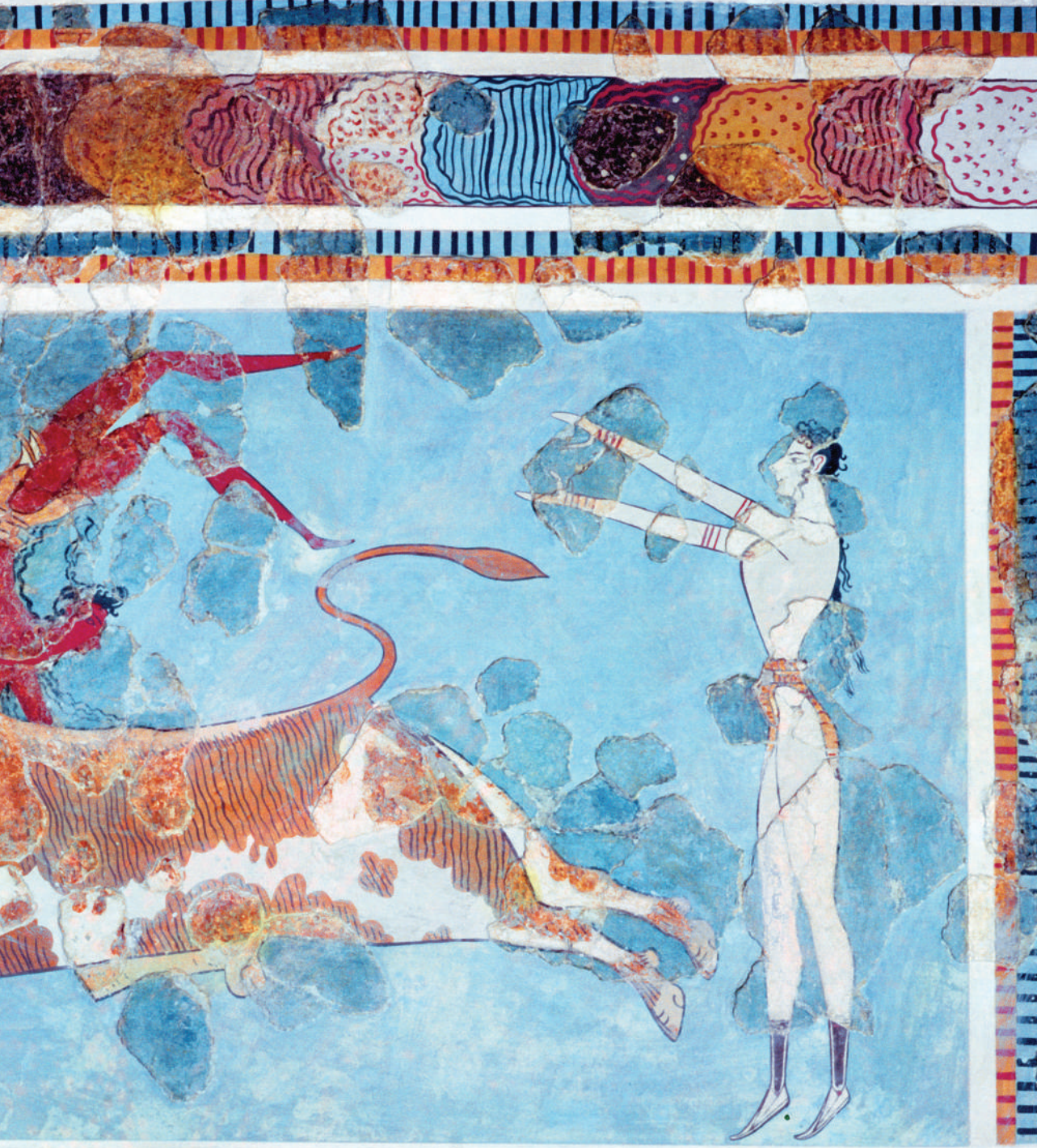
This ancient Greek mural of a charging bull was found on the island of Crete. The ancient Greeks produced beautiful art and architecture.