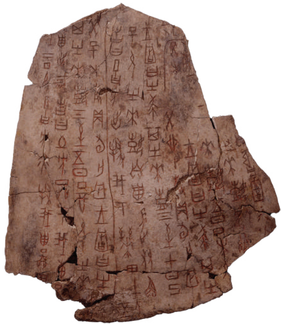
This artifact is an example of ancient Chinese writing etched into a piece of bone.

Some of the oldest known writing in the world was done by the Shang people, who made carvings on animal bones. These bones were used to try to predict what might happen. In ancient China, only the king had the privilege of trying to learn the future. To do so, a message was scratched onto the bones using a system of thousands of symbols. A priest would then apply heat to the bones and look for clues in the way they cracked.