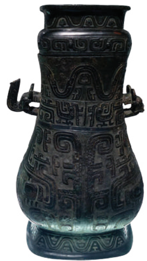
This container for wine was crafted from bronze during the Zhou dynasty.

noble , n. a member of a high social class