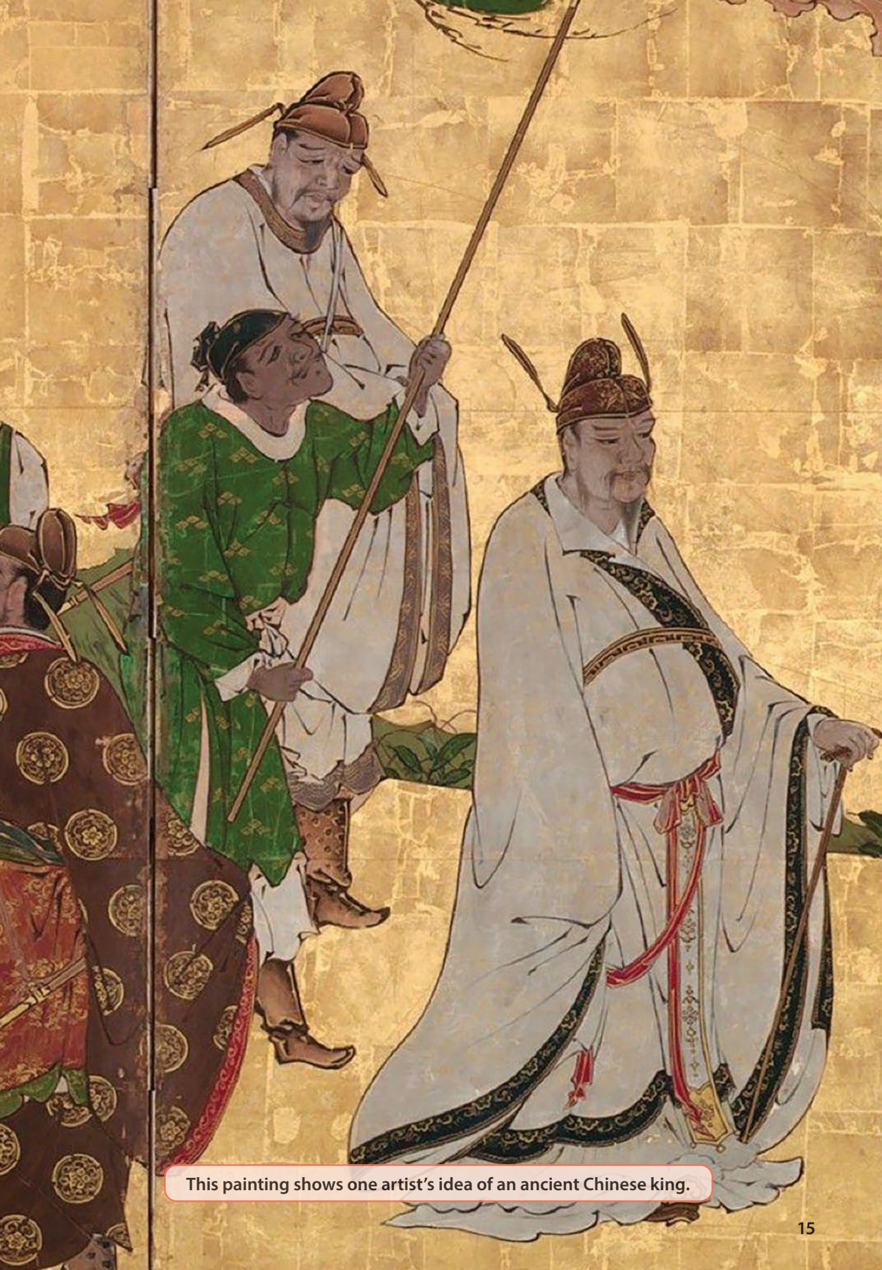
This painting shows one artist's idea of an ancient Chinese king.