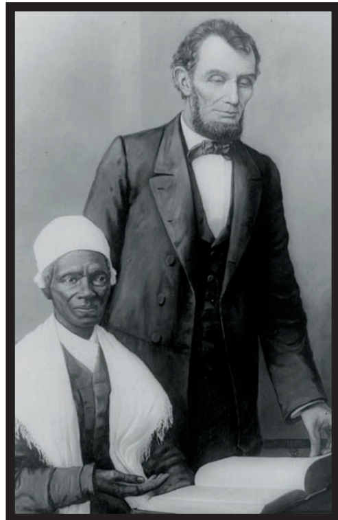
Sojourner Truth with President Abraham Lincoln