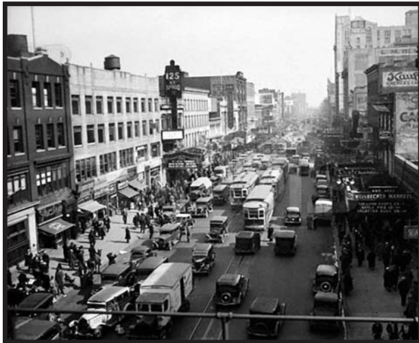
Harlem was a bustling community, circa 1930, as documented in this scene of 125 th Street. The marquee of the Apollo Theater appears on the left side of the street.

elements into a common area of contact and interaction. Within this area, race sympathy and unity have determined a further fusing of sentiment and experience. So what began in terms of segregation becomes more and more, as its element mix and react, the laboratory of a great race-welding. Hitherto, it must be admitted that American Negroes have been a race more in name than in fact, or to be exact, more in sentiment than in experience. e