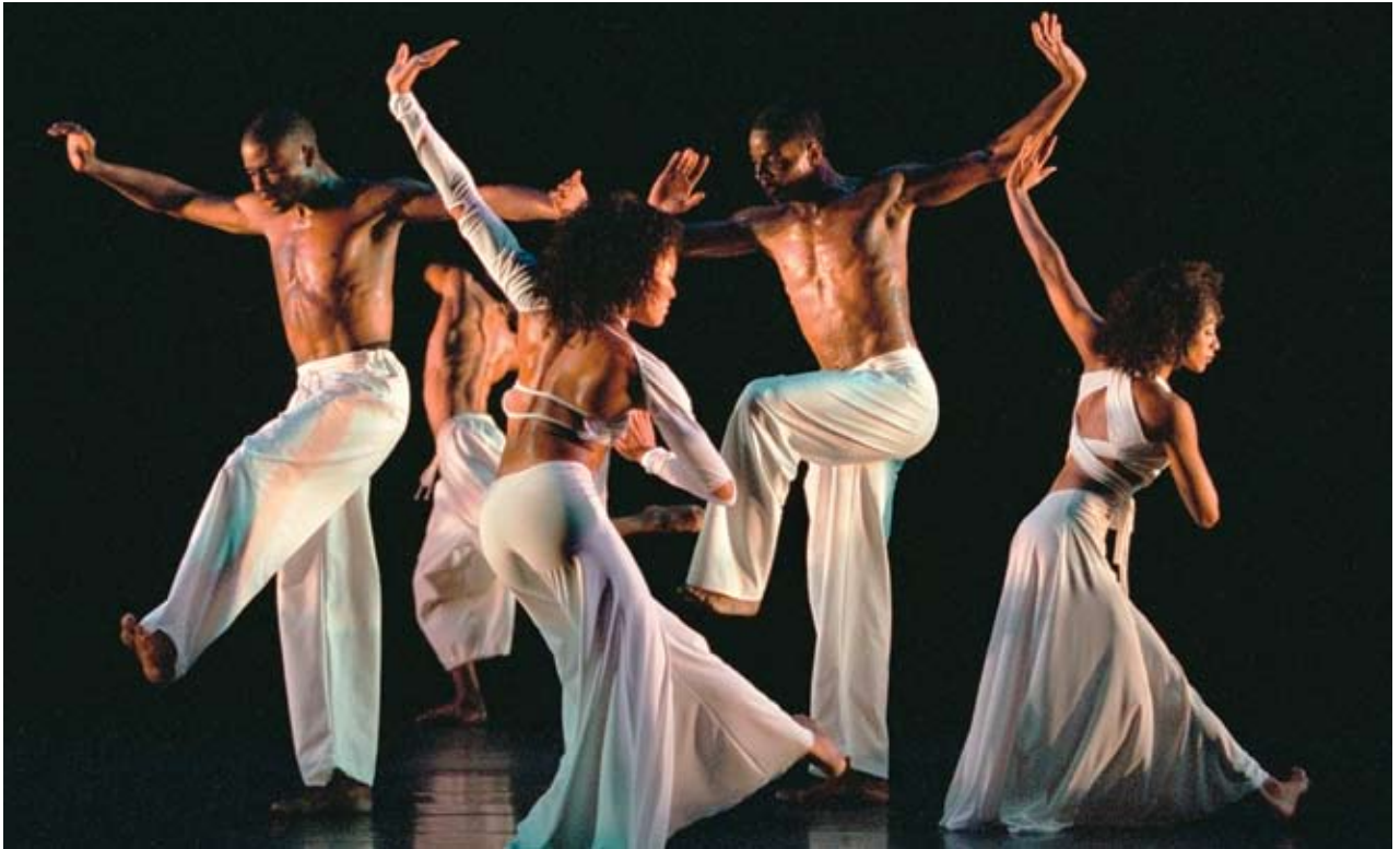
Alvin Ailey American Dance Theater troupe performing Grace (1999).

that she would be required to perform in white face, she promptly refused. She went on to become the first African-American prima ballerina for the Metropolitan Opera in New York and made numerous guest appearances with other companies. As a teacher at the School of American Ballet in New York City and Manhattanville College, she also inspired and trained many aspiring dancers.