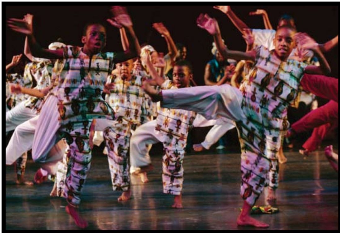
Restoration DanceAfrica Ensemble Performing at the DanceAfrica Festival held at the Brooklyn Academy of Music (1998).