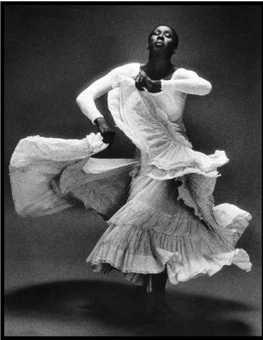
Judith Jamison Performing Cry (1971).

project designed to exhibit and preserve classic modern dance performances by African-American choreographers. Other notable modern dance artists include Garth Fagan (b.1940), Ulysses Dove (1947–1996), Debbie Allen (b.1950), Bill T. Jones (1952), and Blondell Cummings .